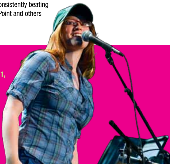
Ingrid Michaelson '01, singer/ songwriter