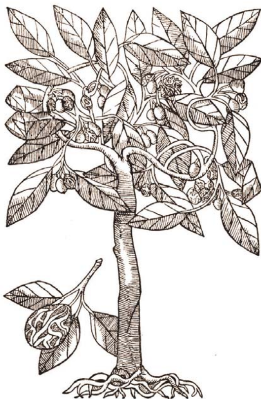
PLATE XIV.—NUEZ MOSCADA. FROM GARCIA DE ORTA: COLLOQUIES ON THE SIMPLES AND DRUGS OF INDIA. PLATE L 4 , NUTMEG.

Session 4 (Plenary Panel): 11:15 a.m. – 12:45 p.m.