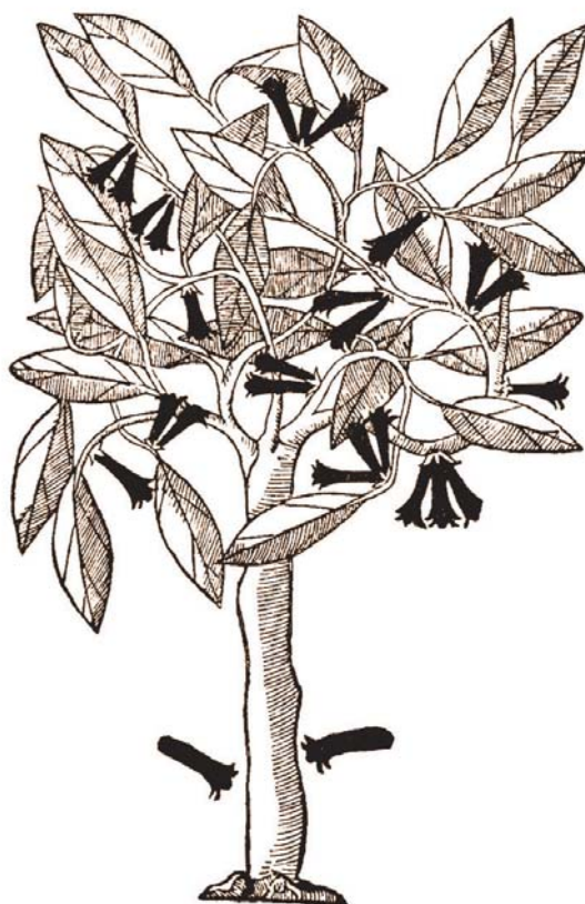
PLATE XI.—CLAVOS. FROM GARCIA DE ORTA: COLLOQUIES ON THE SIMPLS AND DRUGS OF INDIA. PLATE II, CLOVES.