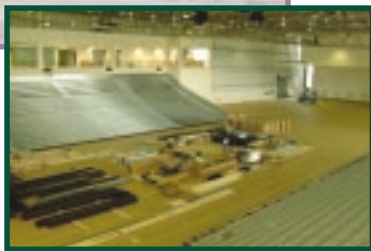
The Jan. 31 men's basketball game against the University of Hartford marked the official opening of the Binghamton University Events Center. Right, a series of photos illustrates progressive construction of the $33 million facility.