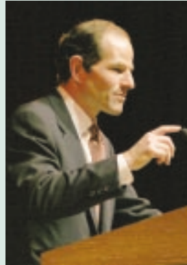
New York State Attorney General Elliot Spitzer delivered the University's annual Abraham J. Briloff Lecture Series on Accounting and Society. Spitzer discussed ethics in financial markets.