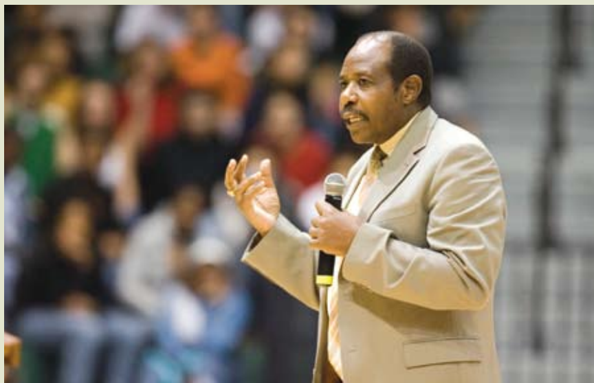
Paul Rusesabagina, the manager of the hotel depicted in the 2004 Oscar-nominated Hotel Rwanda, starring Don Cheadle as Rusesabagina, addressed an estimated 3,000 people Oct. 12 at Binghamton University's Events Center, sharing his story in hopes of educating the world about what took place in Rwanda and what's happening now in Darfur, Sudan.