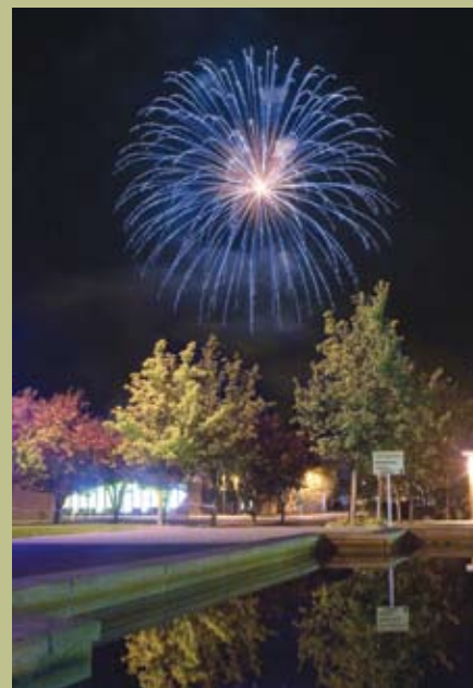
A spectacular fireworks display marked the culmination of the 2006 Homecoming celebration. Nearly 1,000 alumni returned to campus for the annual event. The weekend featured milestone reunions for the classes of 1956, 1971, 1976, 1981, 1986, 1996 and 2001, a Zero-Year reunion for the Class of 2006 and special reunions for WHRW, Off Campus College Transport, Hillel at Binghamton, School of Advanced Technology, Sigma Alpha Epsilon, German majors/minors and alumni who studied abroad in Graz, Austria.