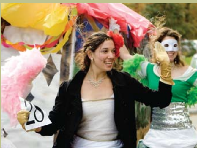
Members of the campus chapter of Habitat for Humanity puttin' on the ritz at the Brain Train Parade during Homecoming Weekend. Mountainview College took first place in the Brain Train Parade, which drew a record number of very spirited floats.