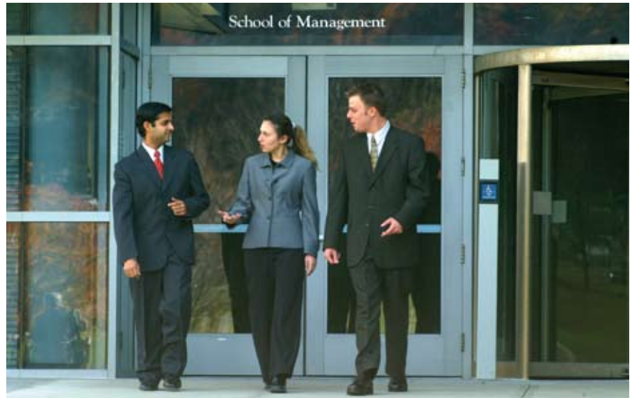
Students in the PricewaterhouseCoopers Scholars Program participate in projects and programs that augment their School of Management curriculum, including the Junior Level International Experience.

accounting and director of the PwC Scholars Program, notes that there is more to the international experience than simply observing business operations. For instance, he said, “the time in Paris was spent absorbing a foreign culture — French culture — which is a critical aspect of success in business today.”