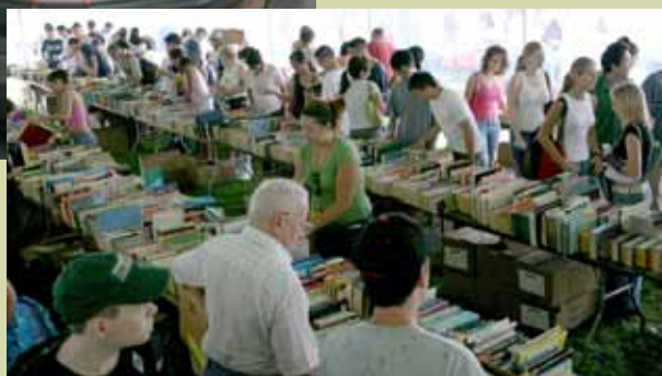
Thousands came away with free books from under the big tent at University Fest.