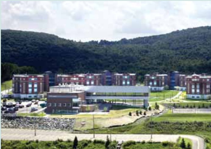
The completed Mountainview College residential community