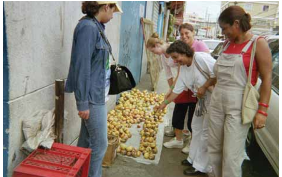
Decker School of Nursing students experience a slice of everyday life shopping on the streets of the Dominican Republic.

Students completed basic health screenings and daily tasks such as setting up and assisting in the clinic pharmacies, but the majority of their work consisted of lab testing for