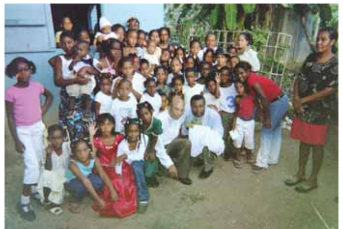
Children gather outside a neighborhood church in the Dominican Republic during a visit to one of the local "bateys" by Decker School nursing students and faculty.